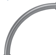
B2SXLMP various radii